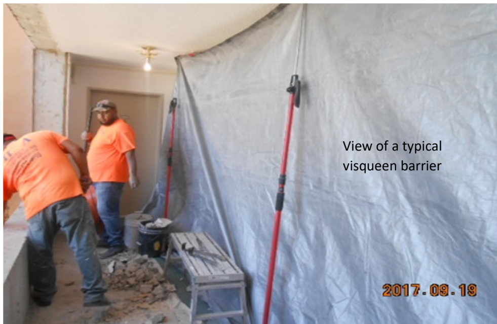
View of a typical visqueen barrier