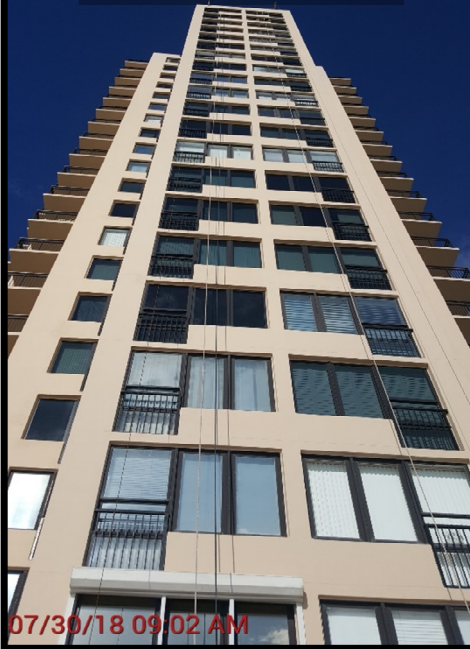
Stack 03/04 Master bedroom drop