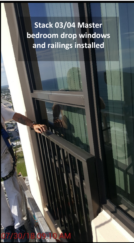
Stack 03/04 Master bedroom drop windows and railings installed